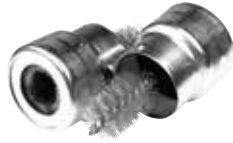
Metal Battery Terminal Brush W147C