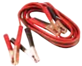
10GA 12' W1670