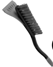
24" Snow Brush/Ice Scraper W1461