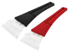
Ice Scraper W9197