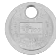
Spark Plug Gapper W3204