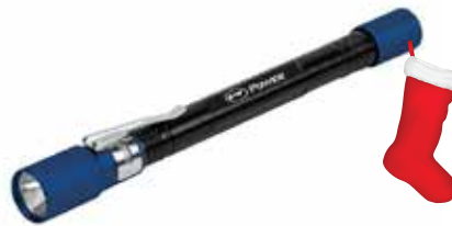
70+LM Penlight 20202 Product Features