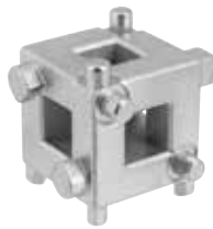
3/8" Dr. Disc Brake Caliper Piston Tool W80621