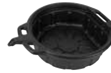
4-1/2 Gallon Oil Drain Pan W4071