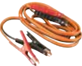
6GA 16' W1672