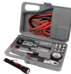
Roadside Safety Tool Kit W1556