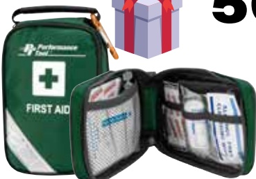
Handyman First Aid Kit W1554