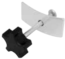
Disc Brake Pad Spreader W209