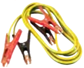
8GA 12' W1671