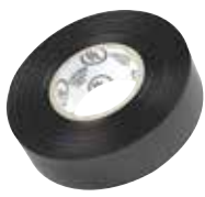
Black Electrical Tape 3/4" x 60' W502