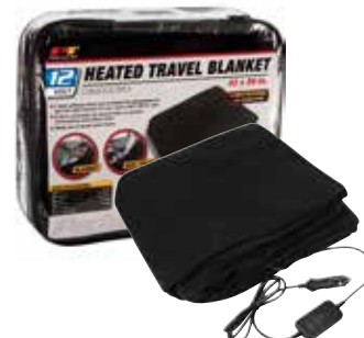
12V Heated Travel Blanket W6049